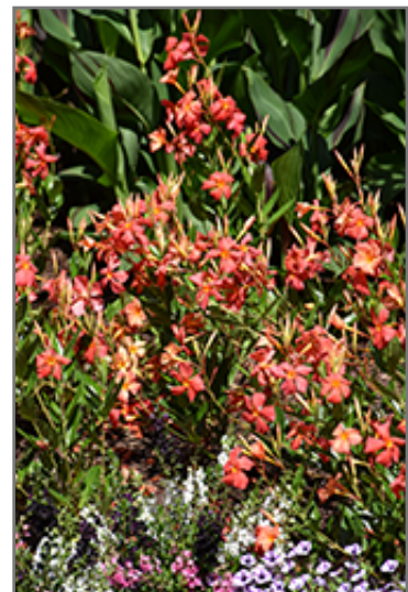
Sun Parasol Fired Up Orange Mandevilla in bloom