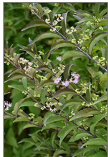
Purple Pride Beautyberry flowers