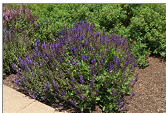
Noble Knight Sage in bloom