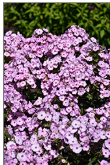
Garden Girls Fancy Girl Garden Phlox flowers

Garden Girls Fancy Girl Garden Phlox is recommended for the following landscape applications;