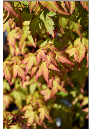
Bihou Japanese Maple foliage