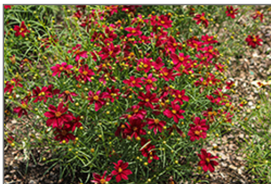
Designer Threads Scarlet Ribbons Tickseed flowers