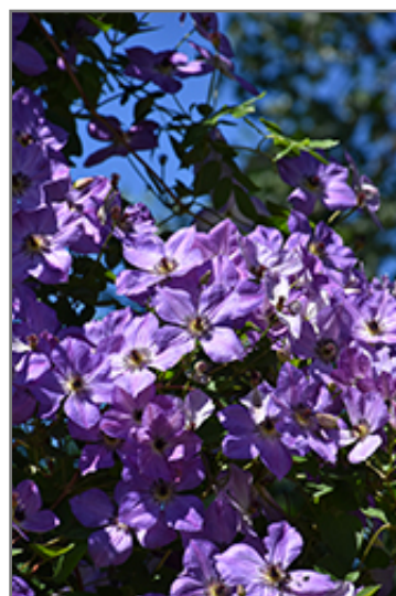
Morning Sky Clematis flowers