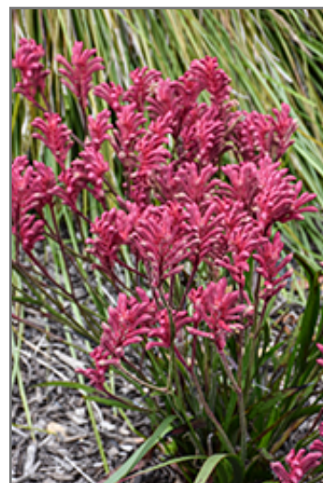
Bush Elegance Kangaroo Paw flowers