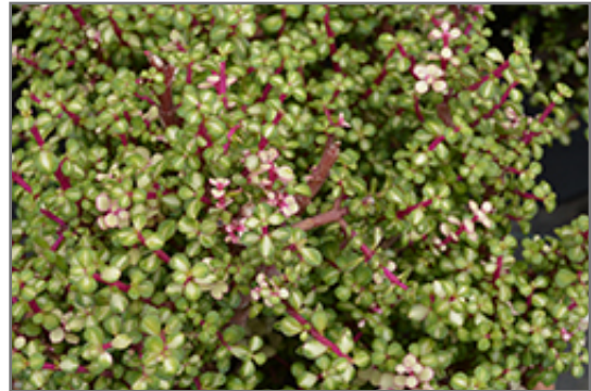
Kaleidoscope Rainbow Bush foliage

Kaleidoscope Rainbow Bush is recommended for the following landscape applications;