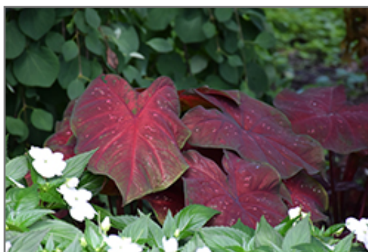
Burst my Bubble Caladium foliage