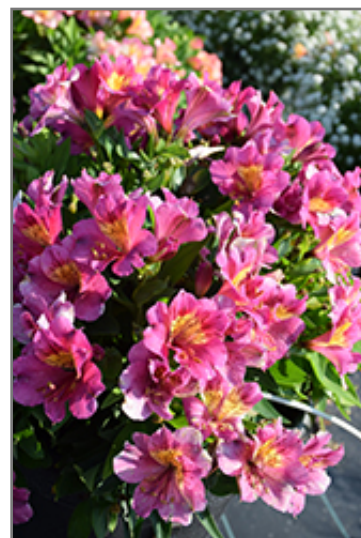
Inticancha Sunstar Alstroemeria flowers