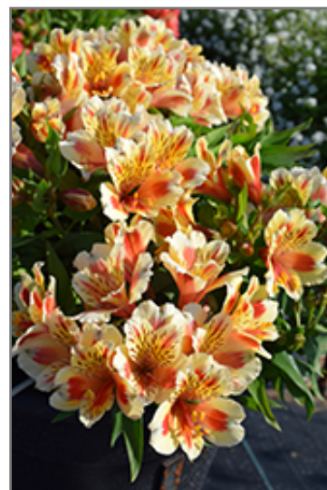
Inticancha Sunset Alstroemeria flowers