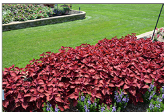
Ruby Slippers Coleus