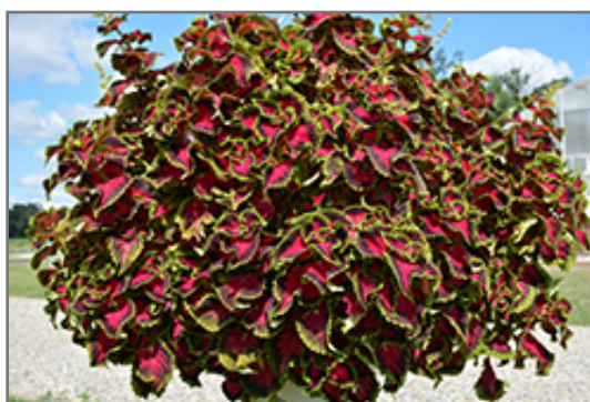
Heartbreaker Coleus