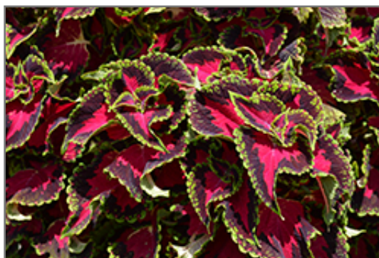
Heartbreaker Coleus foliage

Heartbreaker Coleus is recommended for the following landscape applications;