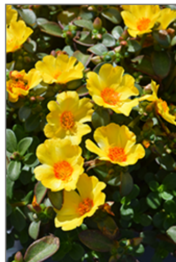
Mega Pazzaz Yellow Twist Portulaca flowers Photo courtesy of NetPS Plant Finder

Mega Pazzaz Yellow Twist Portulaca is recommended for the following landscape applications;