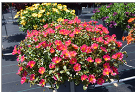
Mega Pazzaz Pink Twist Portulaca in bloom