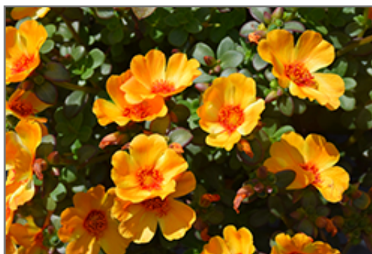
Mega Pazzaz Mango Twist Portulaca flowers

Mega Pazzaz Mango Twist Portulaca is recommended for the following landscape applications;