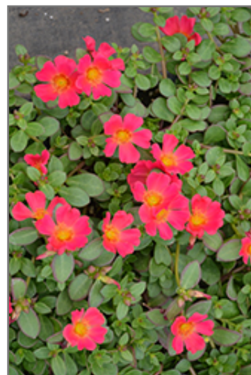
Cupcake Upright Raspberry Portulaca flowers

Cupcake Upright Raspberry Portulaca is recommended for the following landscape applications;