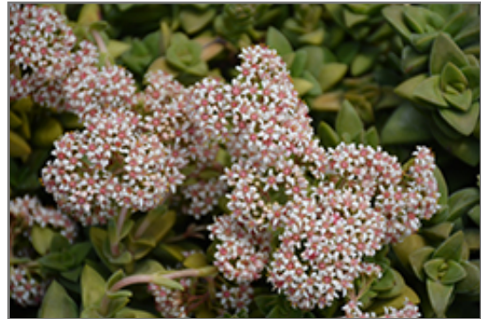
Springtime Crassula flowers

Springtime Crassula will grow to be about 8 inches tall at maturity, with a spread of 24 inches. Its foliage tends to remain low and dense right to the ground. It grows at a slow rate, and under ideal conditions can be expected to live for approximately 15 years. As an evergreen perennial, this plant will typically keep its form and foliage year-round.