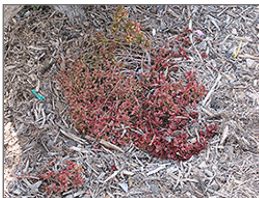
Red Carpet