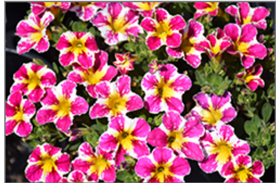
Lia Abstract Pink Calibrachoa flowers

Lia Abstract Pink Calibrachoa is recommended for the following landscape applications;