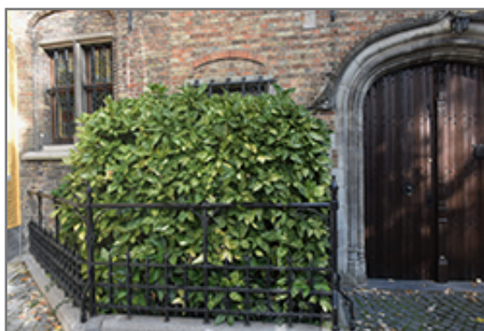
Angelon Aucuba