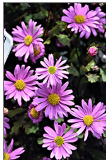
Surdaisy Pink Swan River Daisy flowers