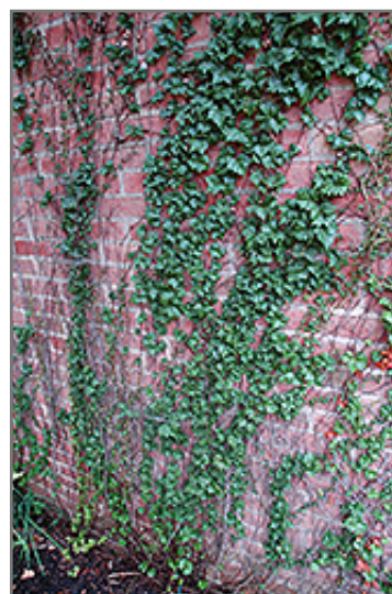
Low's Boston Ivy