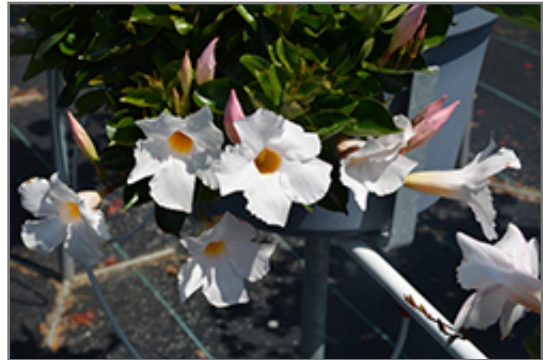
Flordenia White Halo Mandevilla flowers

This plant is native to the tropics and prefers growing in moist environments with evenly warm conditions all year round. In our climate, it is usually grown as an outdoor annual in the garden or in a container. If you want it to survive the winter, it can be brought in to the house and provided with special care, and then returned to the garden the following season. In its preferred tropical habitat, it can grow to be around 24 inches tall at maturity, with a spread of 24 inches. However, when grown as an annual or when overwintered indoors, it can be expected to perform differently, and its exact height and spread will depend on many factors; you may wish to consult with our experts as to how it might perform in your specific application and growing conditions.