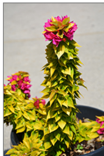
Pixie Queen Bougainvillea flowers