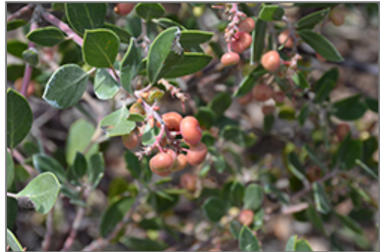
Franciscan Manzanita fruit

Franciscan Manzanita will grow to be about 3 feet tall at maturity, with a spread of 10 feet. It tends to fill out right to the ground and therefore doesn't necessarily require facer plants in front. It grows at a slow rate, and under ideal conditions can be expected to live for approximately 30 years.