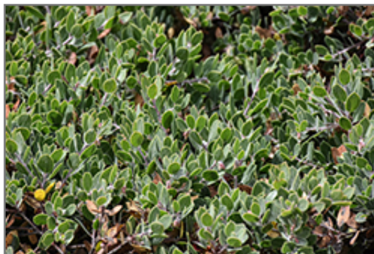
Franciscan Manzanita foliage

Franciscan Manzanita is recommended for the following landscape applications;