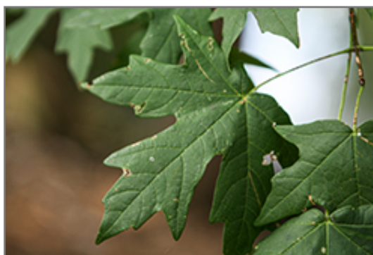
Chalk Maple foliage