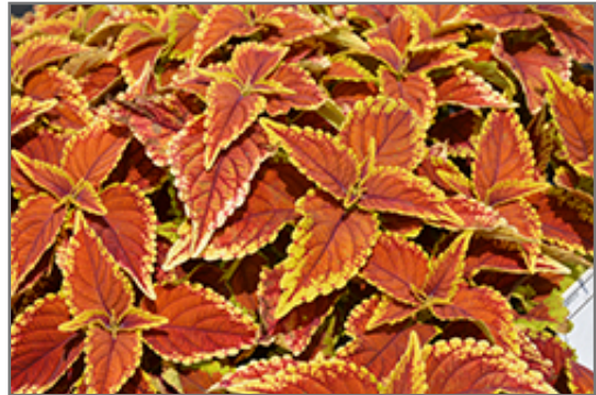
Talavera Sienna Coleus foliage

Talavera Sienna Coleus is a fine choice for the garden, but it is also a good selection for planting in outdoor containers and hanging baskets. It can be used either as 'filler' or as a 'thriller' in the 'spiller-thriller-filler' container combination, depending on the height and form of the other plants used in the container planting. It is even sizeable enough that it can be grown alone in a suitable container. Note that when growing plants in outdoor containers and baskets, they may require more frequent waterings than they would in the yard or garden.