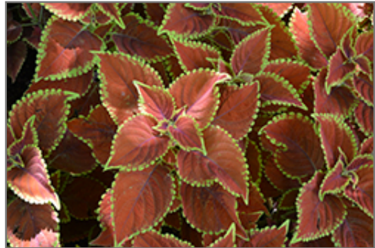
Talavera Sienna Coleus foliage

Talavera Sienna Coleus is recommended for the following landscape applications;