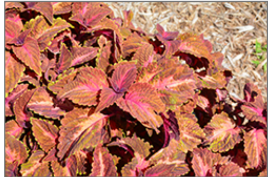
Main Street Sunset Boulevard Coleus foliage

Main Street Sunset Boulevard Coleus is recommended for the following landscape applications;