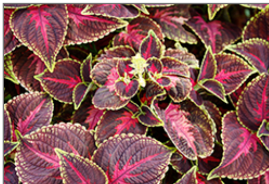
Main Street Orchard Road Coleus foliage