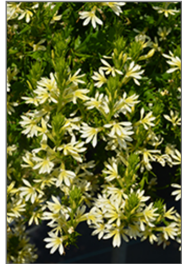
Bombay Yellow Fan Flower flowers