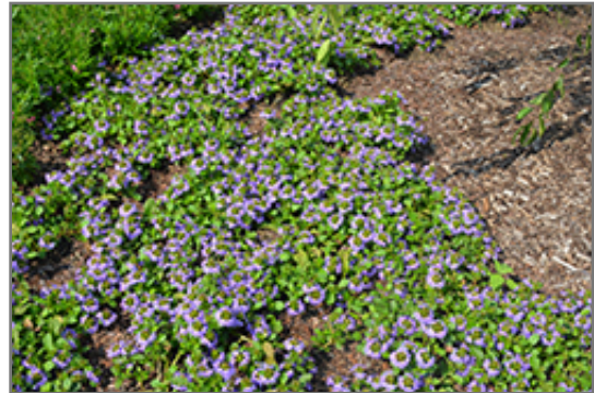
Bombay Compact Dark Blue Fan Flower in bloom

Bombay Compact Dark Blue Fan Flower is a fine choice for the garden, but it is also a good selection for planting in outdoor containers and hanging baskets. Because of its trailing habit of growth, it is ideally suited for use as a 'spiller' in the 'spiller-thriller-filler' container combination; plant it near the edges where it can spill gracefully over the pot. Note that when growing plants in outdoor containers and baskets, they may require more frequent waterings than they would in the yard or garden.