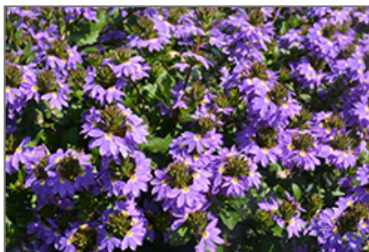
Bombay Compact Dark Blue Fan Flower flowers

Bombay Compact Dark Blue Fan Flower is recommended for the following landscape applications;