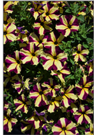
Amore Heart And Soul Petunia flowers

Amore Heart And Soul Petunia is recommended for the following landscape applications;