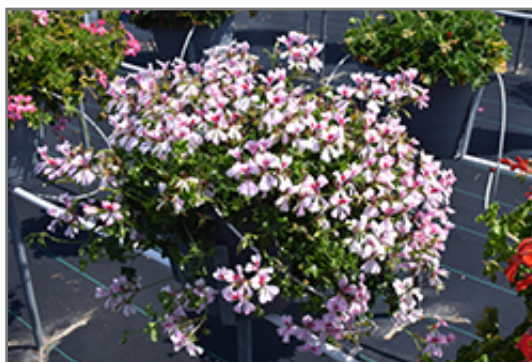
Cascade Appleblossom Geranium in bloom