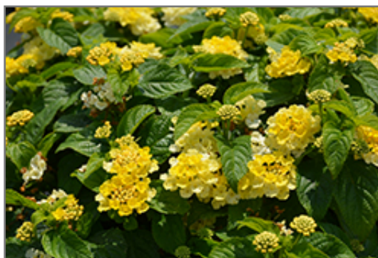
Gem Lemon Quartz Lantana flowers

Gem Lemon Quartz Lantana is recommended for the following landscape applications;