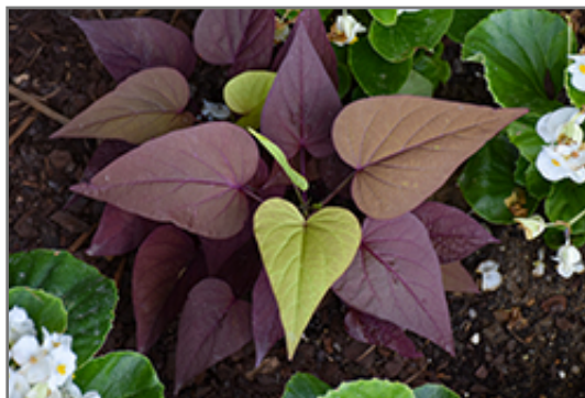
Sweet Georgia Heart Red Sweet Potato Vine foliage