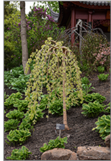
Chaparral Weeping Mulberry in bloom

This plant is not reliably hardy in our region, and certain restrictions may apply; contact the store for more information.