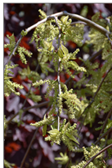
Chaparral Weeping Mulberry flowers