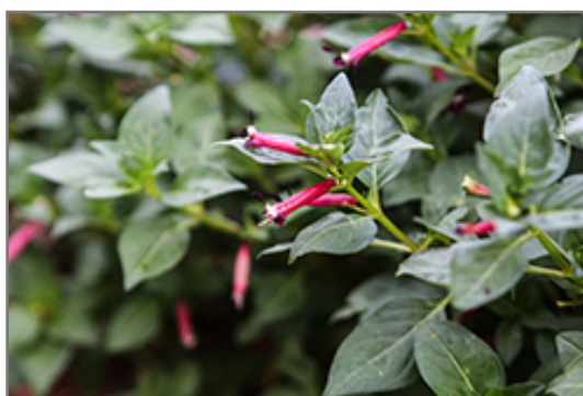
Cubano Cristo False Heather flowers