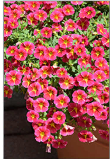
MiniFamous Neo Red Hawaii Calibrachoa flowers

MiniFamous Neo Red Hawaii Calibrachoa is recommended for the following landscape applications;