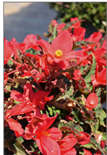
Florencio Cerise Begonia flowers