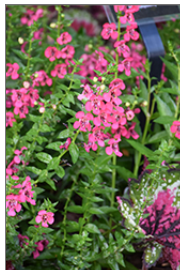
Aria Alta Red Raspberry Angelonia flowers