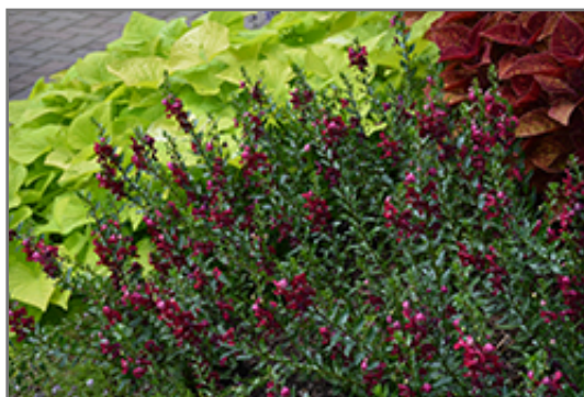
Archangel Ruby Sangria Angelonia in bloom