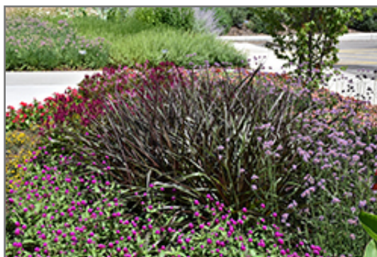
Regal Princess Fountain Grass

Regal Princess Fountain Grass is recommended for the following landscape applications;