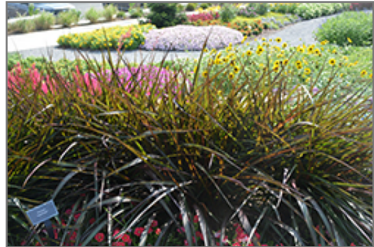
Regal Princess Fountain Grass

Regal Princess Fountain Grass will grow to be about 4 feet tall at maturity, with a spread of 4 feet. Although it's not a true annual, this plant can be expected to behave as an annual in our climate if left outdoors over the winter, usually needing replacement the following year. As such, gardeners should take into consideration that it will perform differently than it would in its native habitat.