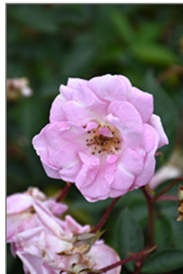
Marie Daly Rose flowers