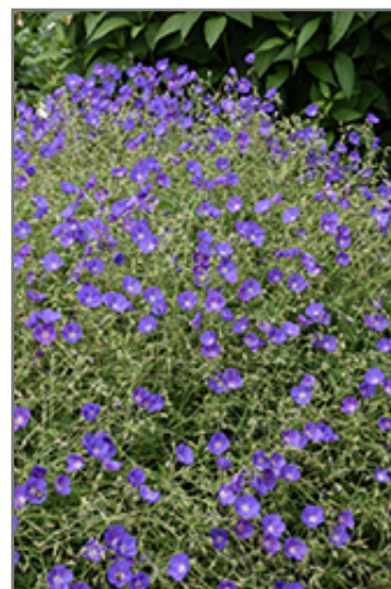
Eureka Blue Cranesbill in bloom