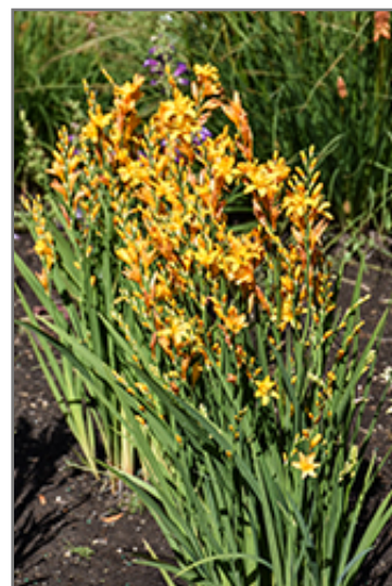
Nova Gold Dragon Crocosmia in bloom