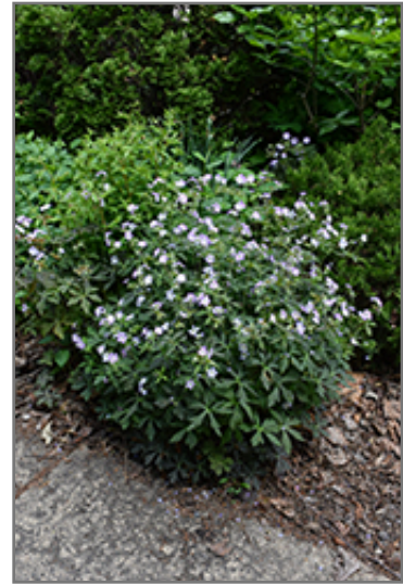
Crane Dance Cranesbill in bloom

This plant is not reliably hardy in our region, and certain restrictions may apply; contact the store for more information.