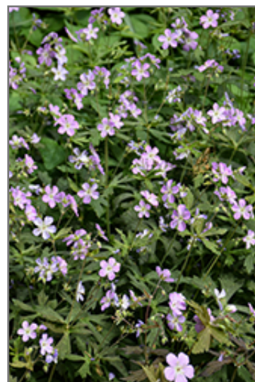
Crane Dance Cranesbill flowers

Crane Dance Cranesbill is recommended for the following landscape applications;