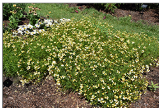
Candlelight Tickseed