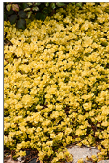
Goldii Creeping Jenny

Goldii Creeping Jenny is recommended for the following landscape applications;